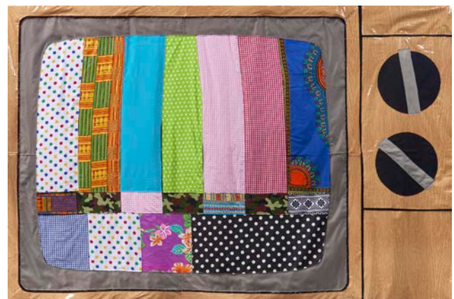
Derrick Adams Fabrication Station #4 2016, fabric collage, 48" x 108". Courtesy the artist and Vigo Gallery, London.