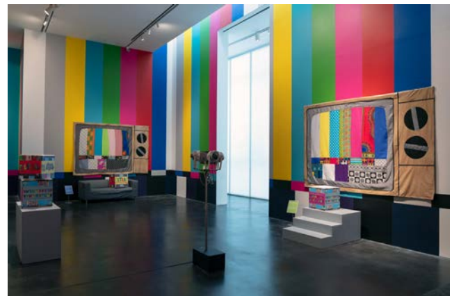
Derrick Adams On (installation view) 2018. Museum of Contemporary Art Denver.