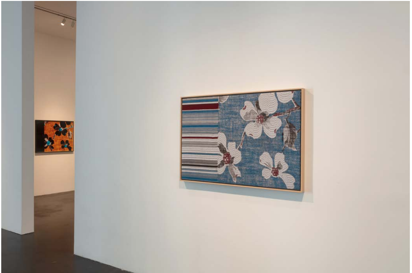
Gallery view right to left: Lisa Oppenheim Jacquard Weave ( Apple Blossoms ), Remnant ( Apple Blossoms ) .

Oppenheim’s exhibition requires effort. I suspect few visitors will make the leap from Hine’s images to the patterned fabrics of the era, photographed and then woven without the assistance of some written or spoken explanation. Clever installation decisions do assist: Oppenheim’s photograph of Apple Blossoms , for example, sits back-to-back on the diving wall from the textile made of the same pattern. While the steps of Oppenheim’s working process aren’t immediately obvious, I am unsure if easy is what we should always expect from the textile. If you are willing to be an active, thinking viewer Spine offers a poetic and troubling reminder of the cost at which textiles have—and continue—to be manufactured.