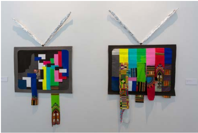
Derrick Adams Colorbar Constellation #3 and Colorbar Constellation #2 2016, acrylic, paper, fabric, pigment-printed canvas, 88" x 44" and 83" x 44".

Colorbar Constellations use the TV set as a recurring frame. Brightly printed strips of textile allude to the color bars used by video engineers in North America to calibrate analog recording or transmission signals. The same striped pattern (from left to right horizontal bands of white, yellow, cyan, green, magenta, red and blue) is painted on the walls of the gallery hosting On , which invites visitors to film themselves staring in fictional talk shows or infomercials livestreamed on the Museum's website. The dominance of celebrity culture and media worship seem to be readings of this work, but the term color bar also refers to social and legal systems in which people of different races are separated and not given the same rights and opportunities.